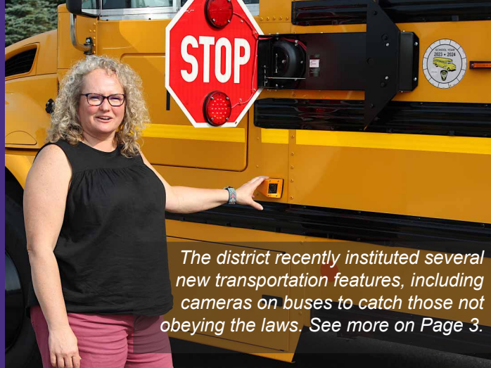
The district recently instituted several new transportation features, including cameras on buses to catch those not obeying the laws. See more on Page 3.